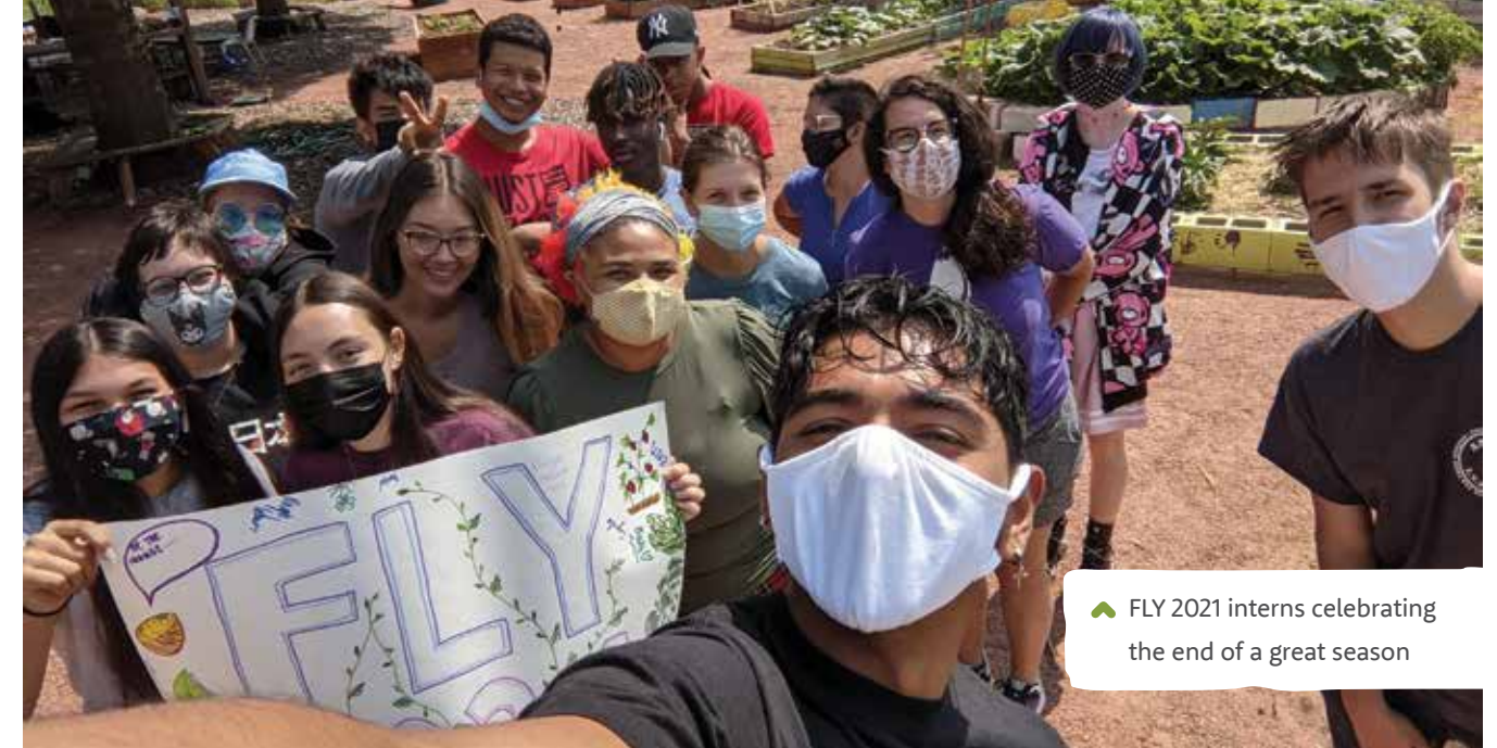
▲ FLY 2021 interns celebrating the end of a great season

Finally, this year will be about deepening and strengthening connections to partners and neighbors via advocacy for structural change to the food system. Our new staff member will be leading our advocacy work and ensuring that we have many avenues through which to listen to our community's concerns about and dreams for the food system.